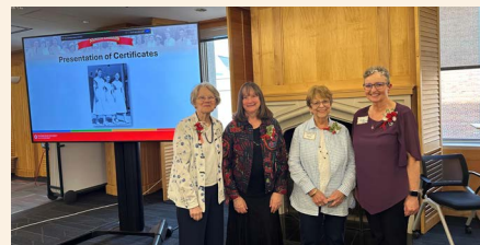
Local Nursing Legends 2025