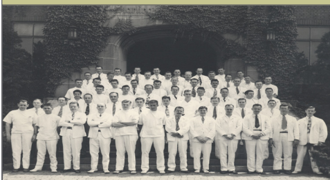
Starling-Loving Hospital Staff, 1947-48