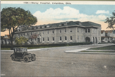
Mercy Hospital, ca. 1930