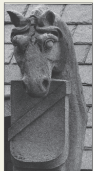
The horse gargoyle on the ledge of Starling-Loving Hall.

The origin of the gargoyles has been solved!