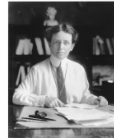
S. Josephine Baker, M.D., Dr. P.H., was a prominent public health physician during the first half of the 20th century. ca. 1920

Women doctors are the focus of a new traveling exhibition opening at the Medical Heritage Center (376 West 10th Ave, 5th floor) on April 7, 2010. “Changing the Face of Medicine: Celebrating America’s Women Physicians” tells the extraordinary story of how American women who wanted to practice medicine struggled over the past two centuries to gain access to medical education and to work in the medical specialty they chose.