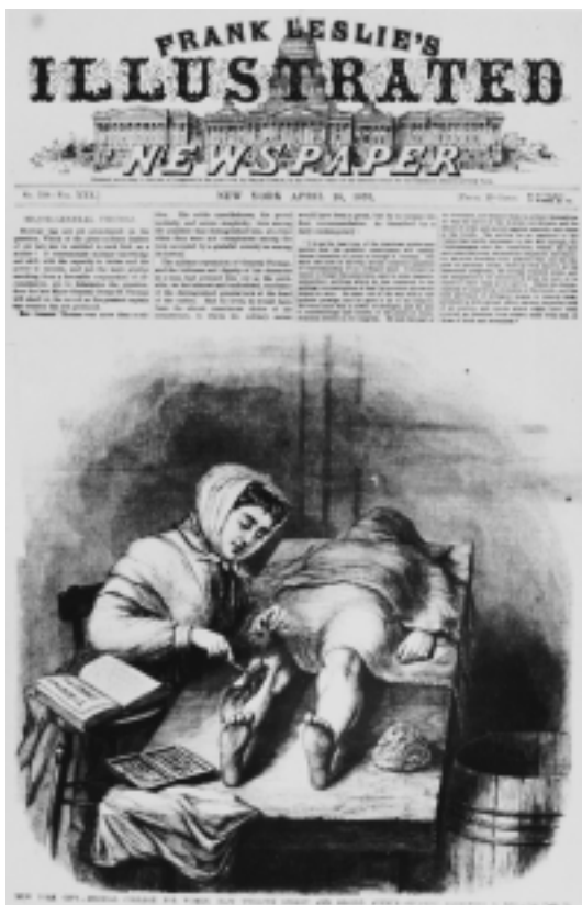
An illustration of anatomical lectures at the Women's Medical College of the New York Infirmary, Frank Leslie's Illustrated Newspaper, April 16, 1870. The Women's Medical College was founded by Dr. Elizabeth Blackwell and her sister, Emily Blackwell, in 1869.

minorities entering medical school and practice.”