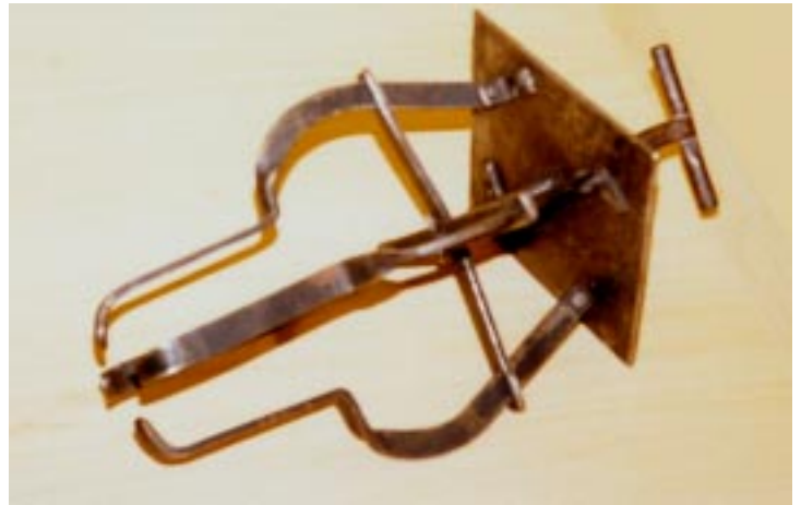
Photo of an early gynecological instrument