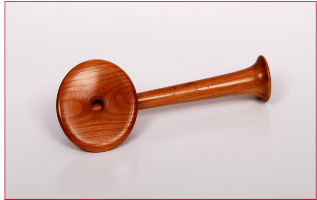
Monaural Stethoscope, one of the more than 4,500 artifacts

Currently, we are actively seeking white nursing shoes to go along with our expanding collection of nursing uniforms; and archival collections of female and minority physicians.