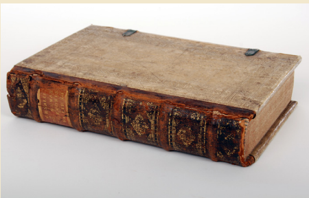
Vesalius's De Humani Corporis Fabrica (1555) is the oldest book at the Medical Heritage Center