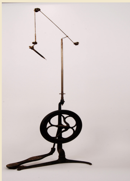
Foot Powered Dental Drill