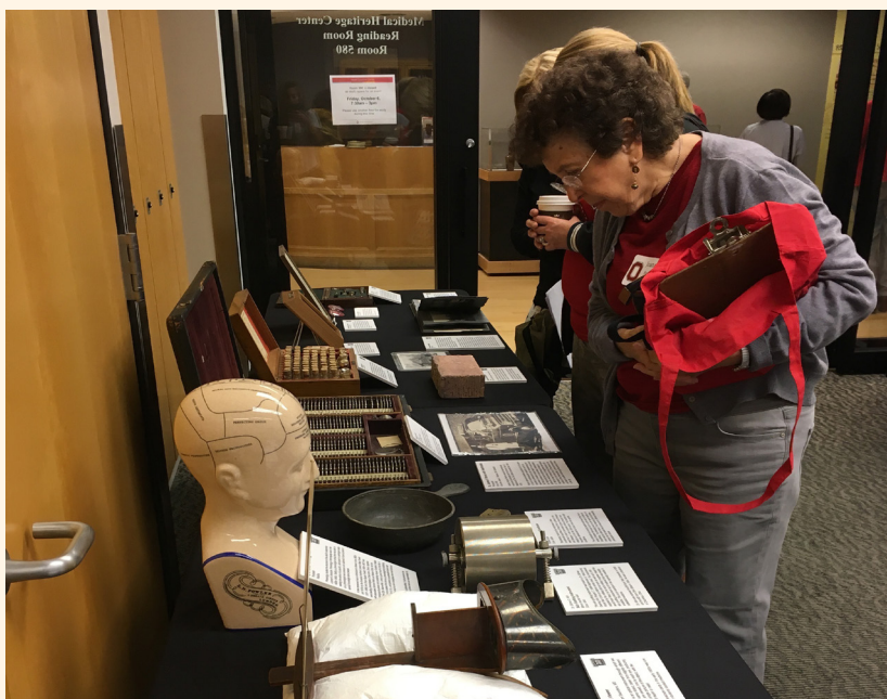
College of Nursing Open House

As we look towards the future, the Medical Heritage Center has been proud to serve as a “hub” of medical humanities activity across campus and we were enthusiastic about being a partner in the 2018 Medical Humanities: From Campus to Communities Conference at OSU from April 13-14.