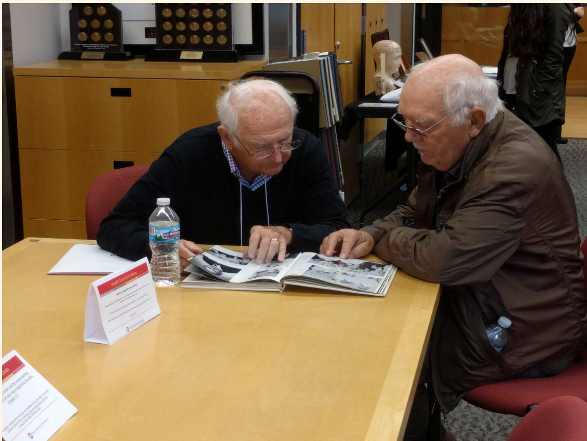
College of Medicine Open House