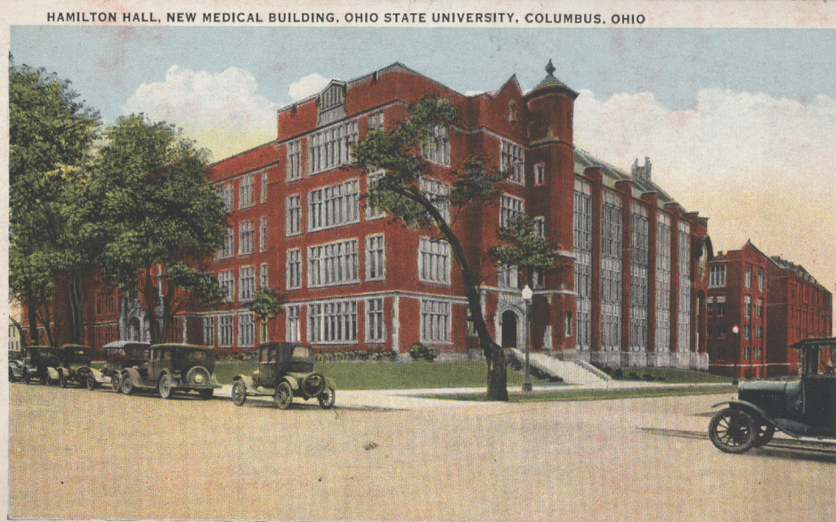
Postcard of Hamilton Hall, C.1930

©2018 Medical Heritage Center; All rights reserved. Reprints with permission