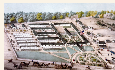
Freedmens Hospital color lithograph