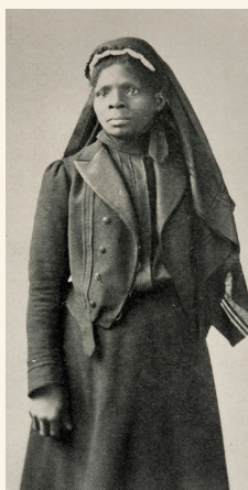
Susie King Taylor