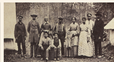
Group of Contraband working for the Union Army