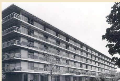
Ohio Tuberculosis Hospital, later Means Hall